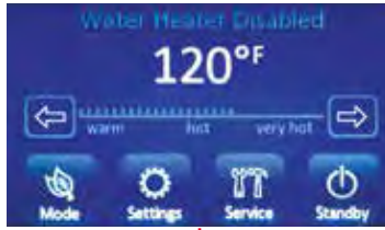
Start Up Screen