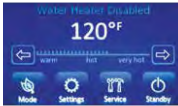
Start Up Screen